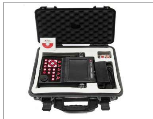
The Whole Unit